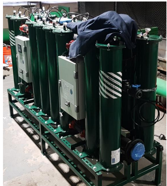
The UET unit treating cooling towers on site